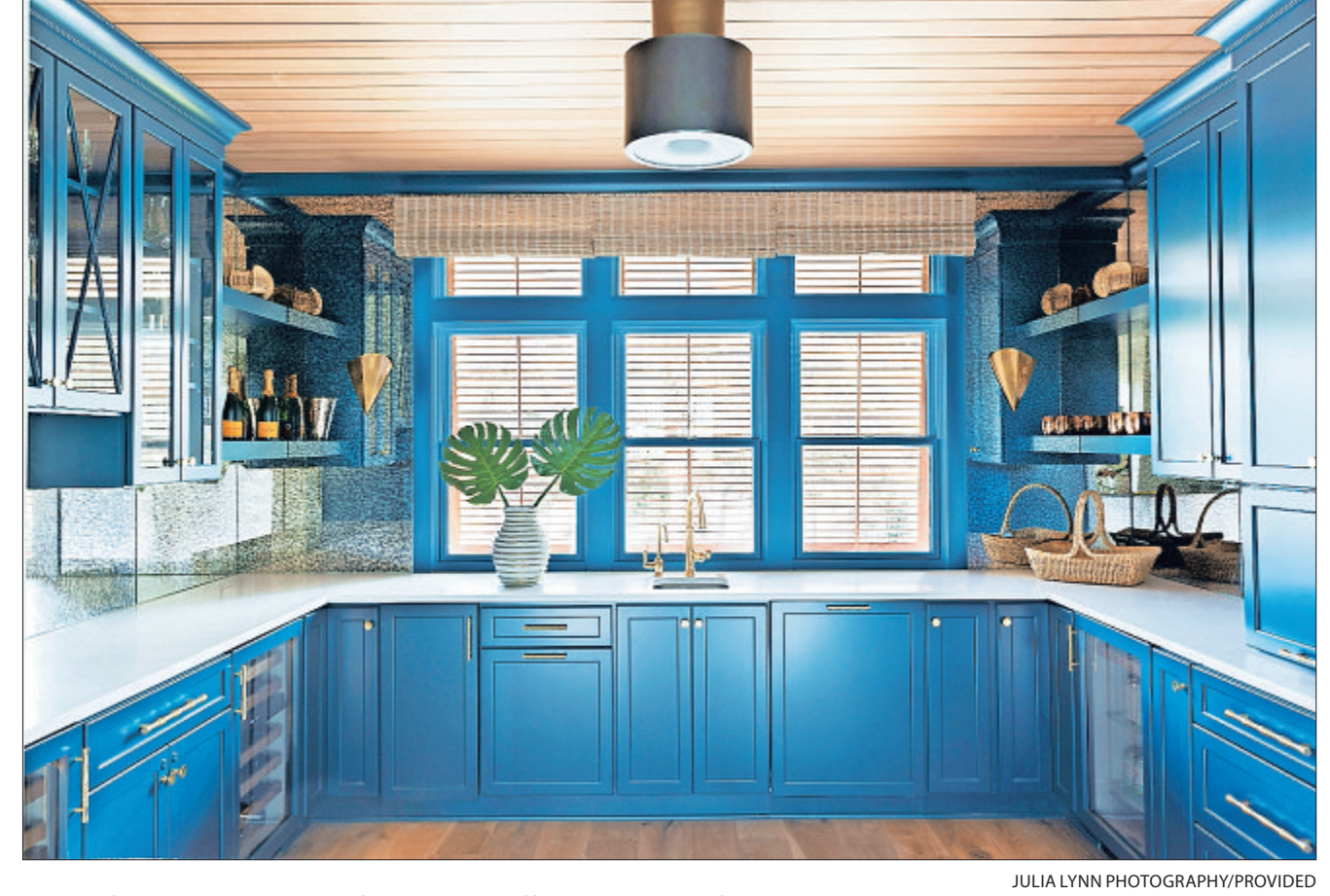
A breakfast nook with a view of Shem Creek offers another way for this Mount Pleasant home to bring the outdoors in.