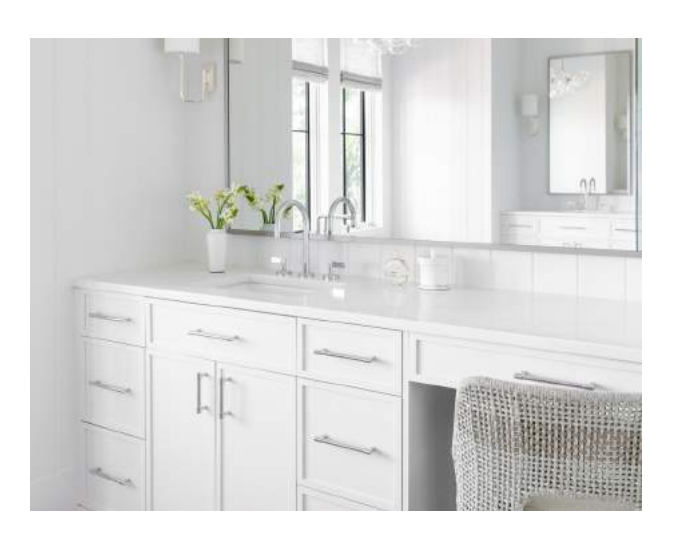
Monochromatic Color Scheme with Makeup Vanity

For more information, call Curtis Daniel Homes at (843) 901-5801 or visit curtisdanielhomes.com.